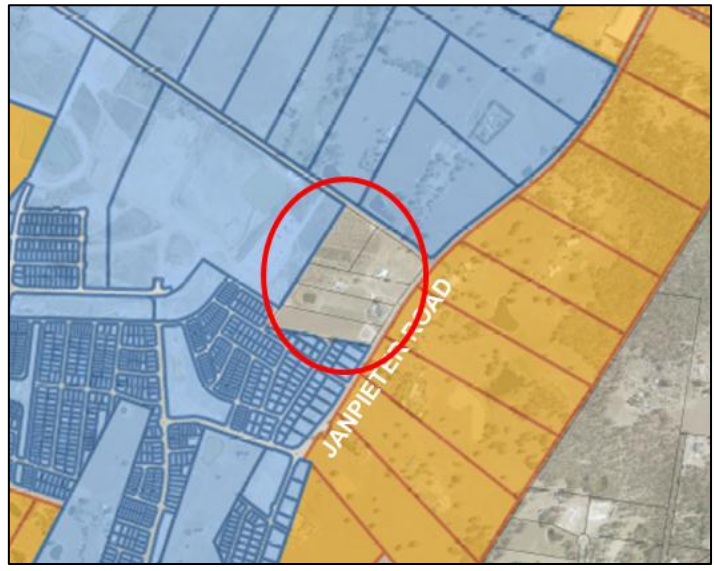
Figure 1: Properties not within Flow Systems' Service Agreement