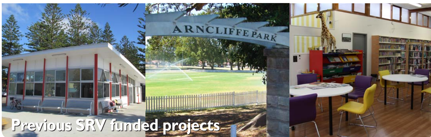
Previous SRV funded projects

Renewing Rockdale is a Program of works that Council proposes to continue supporting community life today and in the future. The Program of works will deliver improvements to the standard of community buildings, amenities, playgrounds, roads, parks, sports fields and the foreshore along Lady Robinsons Beach (see pages 4-5 for a complete list of the program). To pay for the Renewing Rockdale Program of works, Council is proposing through a Special Rate Variation (SRV), to increase residential and business rates with a total rate rise of 6% every year for 4 years.