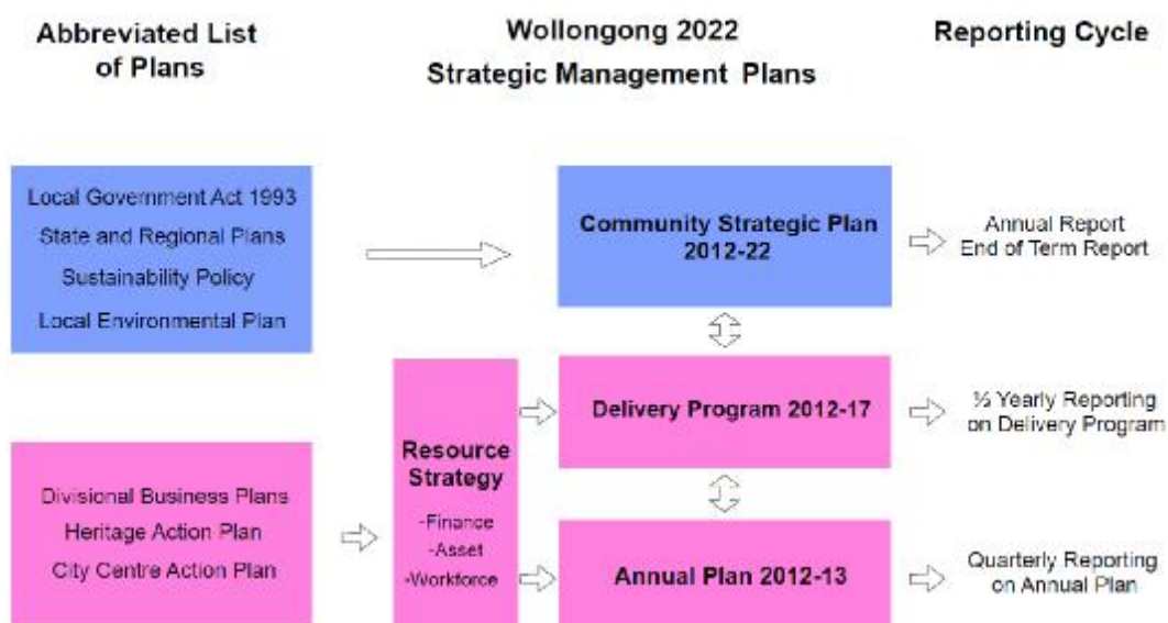
Figure 2: Relationship between Wollongong 2022 Community Strategic Plan and other plans

During the development of Wollongong 2022, consideration was given to the goals, objectives and strategies of other key plans for our region. These include the NSW State and Regional Plans as well as Council’s existing policies, strategies and plans.