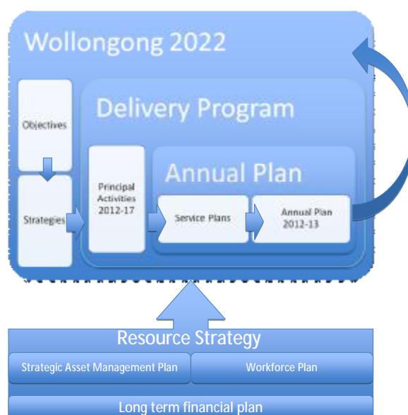
Figure 1: Wollongong City Council's Integrated Planning and Reporting Framework

Resourcing Strategy has been prepared. This strategy includes Asset Management Strategy, Workforce Plan and Long Term Financial Plan. These supporting plans can be found on Council's website www.wollongong.nsw.gov.au .