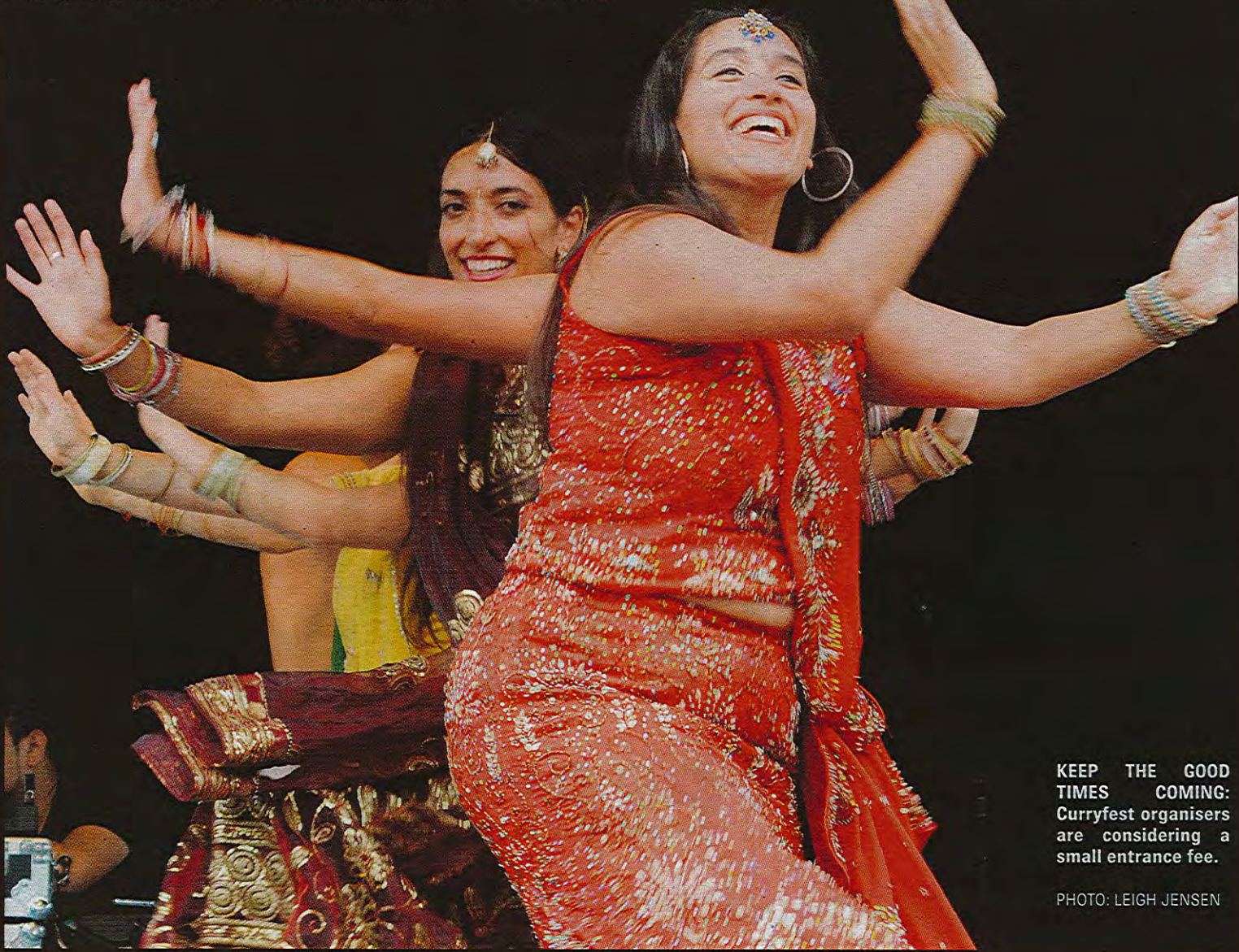
KEEP THE GOOD TIMES COMING: Curryfest organisers are considering a small entrance fee.

By the third year, this would mean the average residential ratepayer would be paying about $165.29 per year, or $3.18 per week, more than if just the rate peg increase was applied.