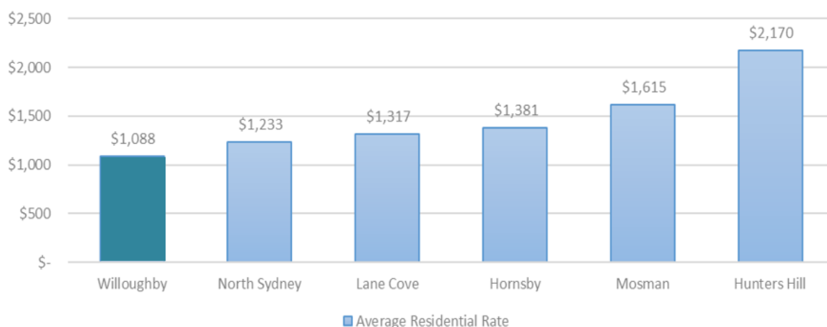
Figure 4 – Average residential rate among Northern Sydney councils in 2023/24