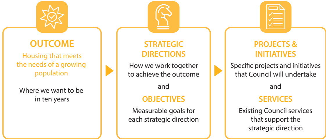
Figure 2: Structure of the Housing Strategy Supplement

Figure 2 illustrates the structure of the supplement.