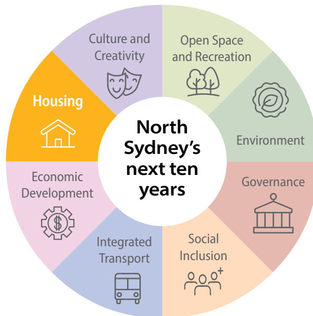
Figure 1: Suite of Informing Strategies

The NSLHS (as summarised and updated in this supplement) is part of a suite of informing strategies (see Figure 1) that articulate North Sydney's needs and priorities over the next ten years. These strategies, including this supplement, will form the basis for Council's new Community Strategic Plan (CSP) 2025-2035, Delivery Programs and Operational Plans.