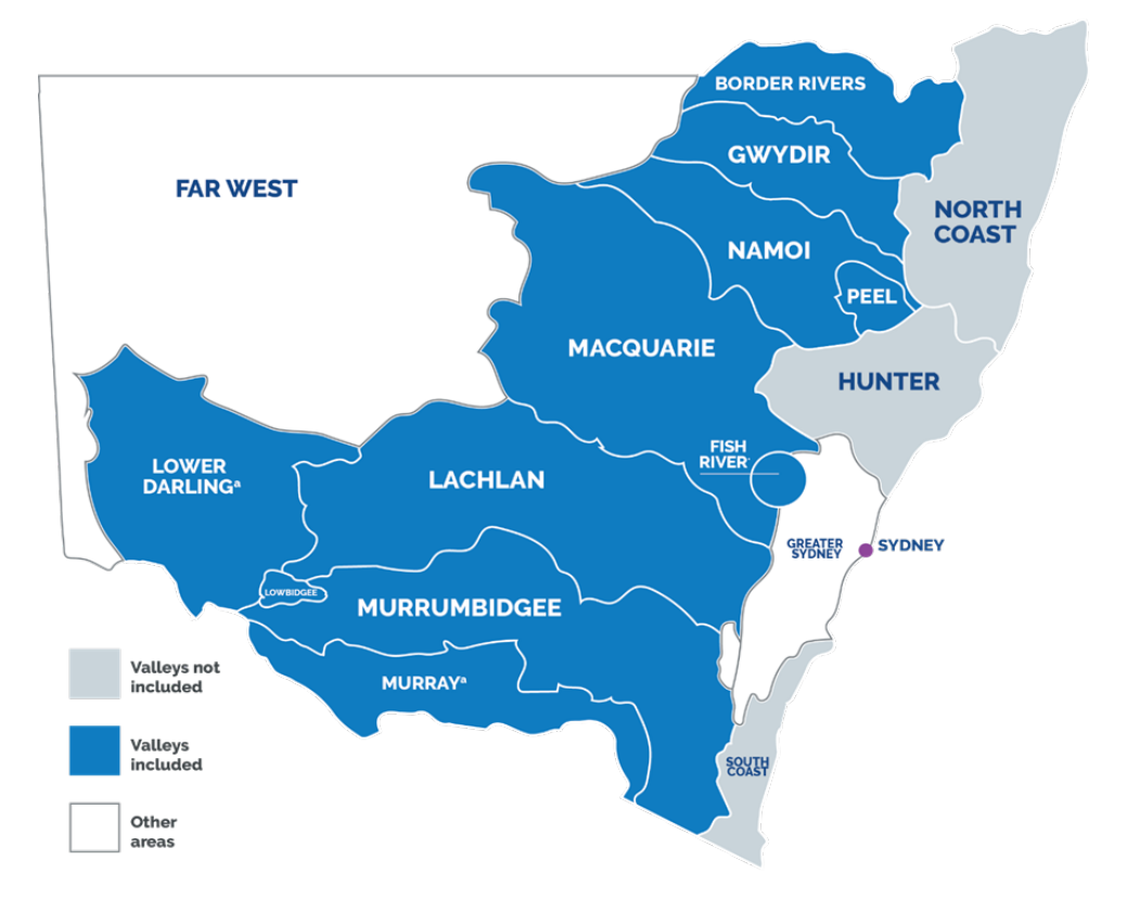
Figure 1 Valleys in and out of the scope of this annual review

Note: This map is not to scale and is for illustrative purposes only. This annual review excludes urban customers in Fish River.