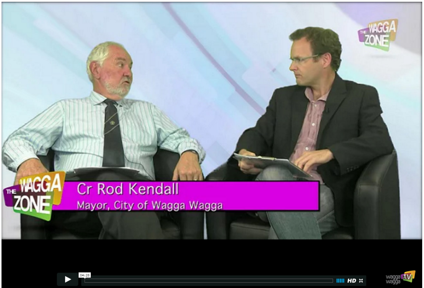
Wagga Wagga Mayor answers proposed Special Rate Variation questions wagga.nsw.gov.au/srv

The Wagga Zone (week 10), Wagga TV https://vimeo.com/146980590