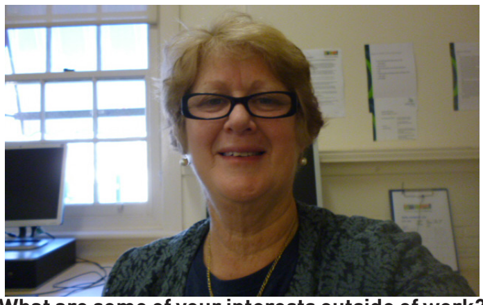
What are some of your interests outside of work?

Rudeness and being ill mannered to others.