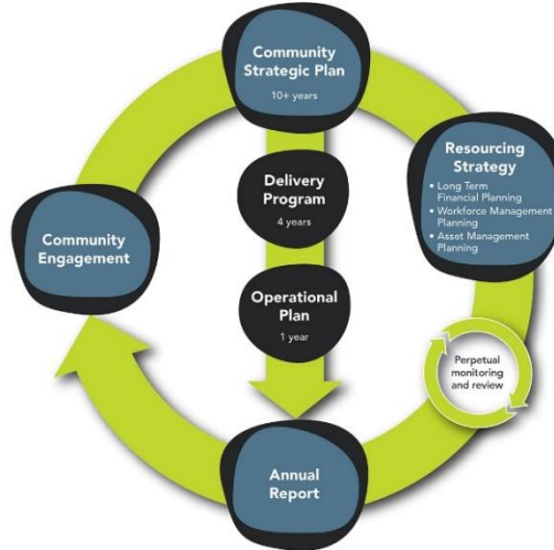
Figure 1 – The Integrated Planning and Reporting Framework

In 2009 a new Integrated Planning and Reporting framework was introduced by the NSW State Government to help improve the way local government strategically plans for the future, and to ensure council planning is reflective of communities' needs.